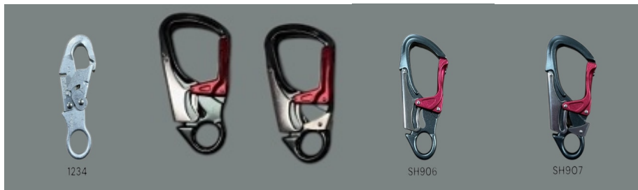
Pic 1: Self-Locking Snaps