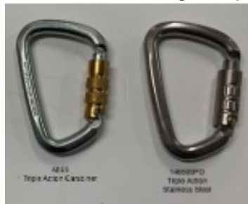
Pic 2: Carabiners